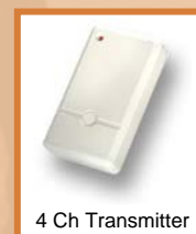
4 Ch Transmitter