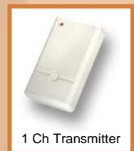
1 Ch Transmitter