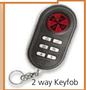
2 way Keyfob