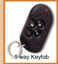
1 way Keyfob