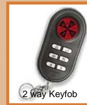
2 Way Keyfob