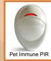
Pet Immune PIR