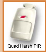
Quad Harsh PIR