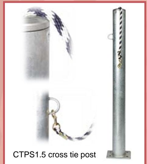
CTPS1.5 cross tie post

Kylix UK have a team of professional installers including qualified electricians where additional electrical services are required to fit and commission your Solarium. All necessary fixings and Solarium hardware mounting systems (excluding steel supports and electrical lift units) are supplied as part of the service.