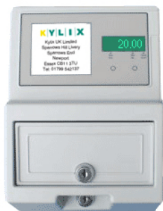
Token OR coin timer control unit