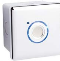
SCBT Timer control unit