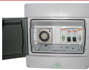
Anky control unit