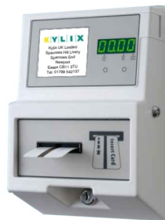
Smart card control unit