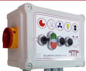
Hester control unit