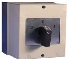
SCB Standard control unit