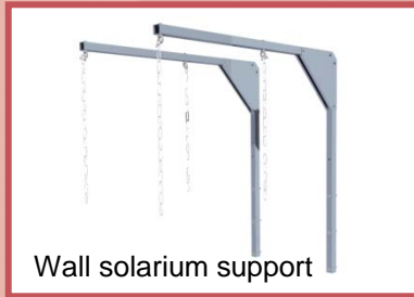
Wall solarium support