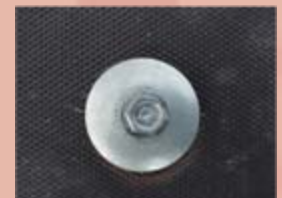
A close-up of the AB tek screw with the 29mm washer in place